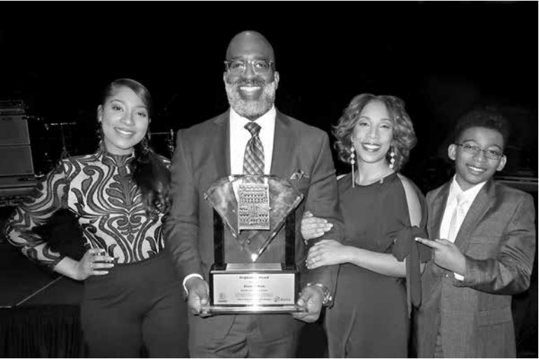
Here I'm pictured with my family after receiving the General Motors African Ancestry Network award for CATTa.