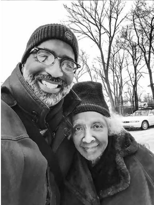
The first love of my life. Miss you Mama.