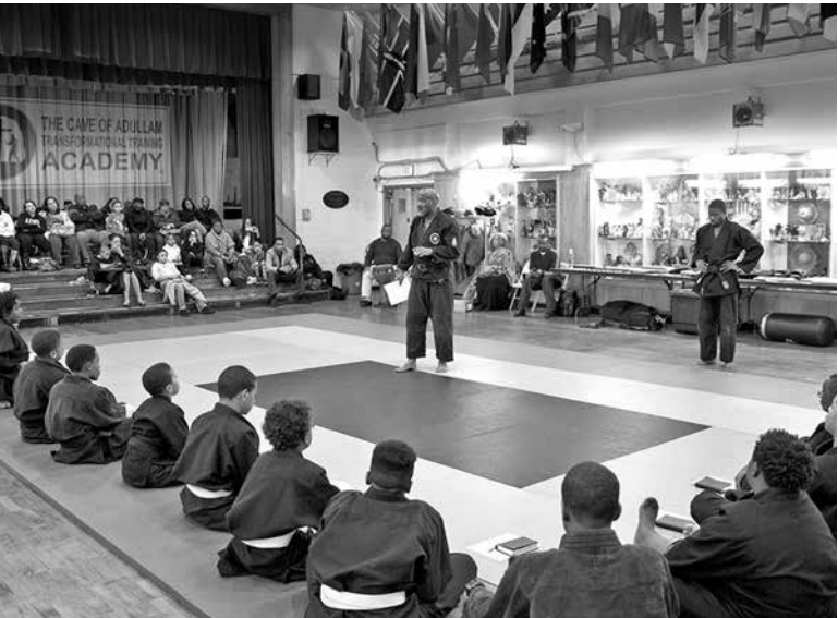
Teaching, training, and transforming boys, young men, and families in CATTa.