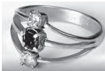
Sofia's "Anna Karenina" ring. ‡

When the novel Anna Karenina was completely finished and published, I asked Lev Nikolaevich for a small gift in return for all my zealous transcribing. And when he went to Moscow [she does not indicate the date], he bought me a very fine ring, with a ruby in the centre and two diamonds—one on either side. I always liked any kind of jewelry, finery and sparkling stones, and I am wearing this ring right now on my finger. †