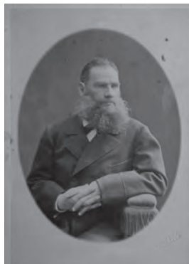
Tolstoy in 1876 ‡