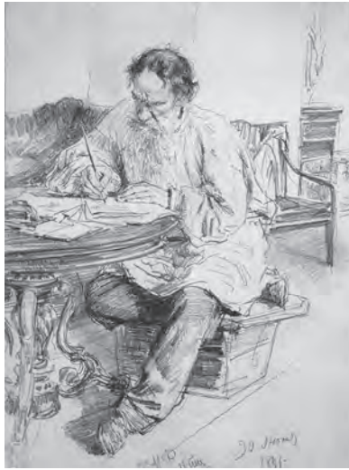
Leo Tolstoy working at the round table, 1891, by Ilya Repin.*