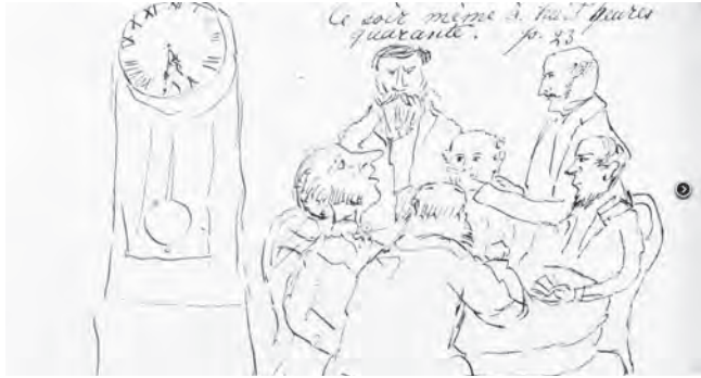
Two of Tolstoy's several illustrations for his children from Jules Verne's La Tour du Monde (Around the World in Eighty Days)