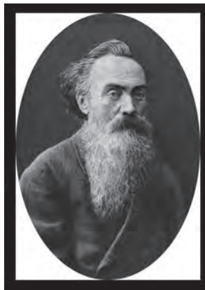
Nikolay Nikolayevich Strakhov (1828–1896), Tolstoy's literary conscience and closest friend during the writing of Anna Karenina.*