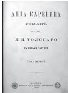
Cover of the first book edition of Anna Karenina . *

When the novel Anna Karenina was completely finished and published, I asked Lev Nikolaevich for a small gift in return for all my zealous transcribing. And when he went to Moscow [she does not indicate the date], he bought me a very fine ring, with a ruby in the centre and two diamonds—one on either side. I always liked any kind of jewelry, finery and sparkling stones, and I am wearing this ring right now on my finger. †